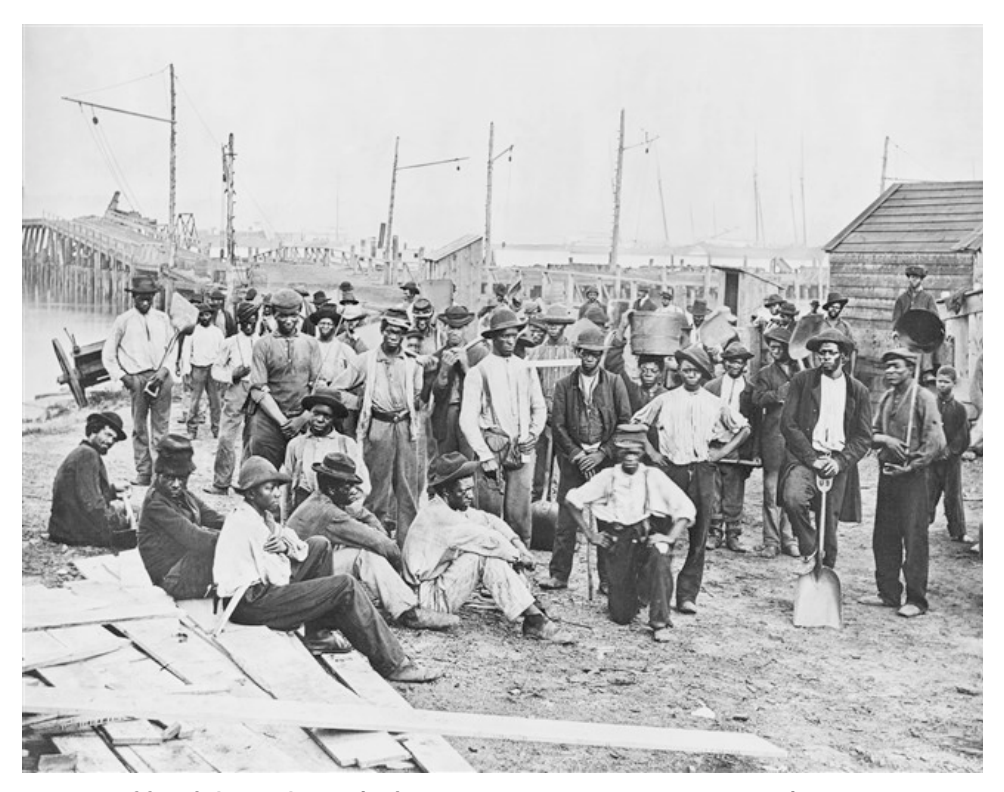
A group of freed slaves along a harbor c. 1863.